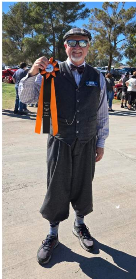
Club Ribbon - Best Car Club